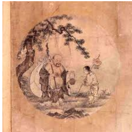
Figure 8 Tenth Ox Herding Picture: Entering the Market with Helping Hands

The same is true for the practice of organizational maintenance. It is a contemplative art that arouses “whole body and mind” seeing, a phrase Dogen used to describe the total merging of subject and object, or seer and the seen, of self and other (Loori, 2005). This organizational art is depicted in the last of The Oxherding Pictures , “Entering the Market with Helping Hands,” a classic Zen text from the 12 th century which expresses--through visual art, along with accompanying prose--the journey towards the full experience of awakening (see Figure 8 below). The series of pictures provides a map of the spiritual journey for the lost ox and the fruition of such a search. The ox, of course, symbolizes our true nature and authentic self, or the Zen notion of “no mind.”