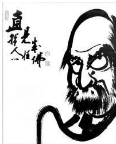
Figure 4 Daruma by Hakuin

of Daruma, or the Bodhidharma, the First Zen Patriarch (see Figure 4). Hakuin not only made liberal use of zengas as visual sermons, but he is also known as a seminal figure in revitalizing koan study in the Rinzai Zen school. Most Westerners have heard his popular koan, “What is the sound of one hand?” Surprisingly, Hakuin did not start painting until he was sixty years old. In the course of twenty-four years he had produced more than a thousand zenga paintings and calligraphy scrolls. What is striking about his various artistic works is the sense of abandon and vitality inherent in his brushstrokes, as well as freedom from the religious conventions of his day. Hakuin’s signature expression is captured in the irreverence, irony and even at times satirical nature of his visual themes and content.