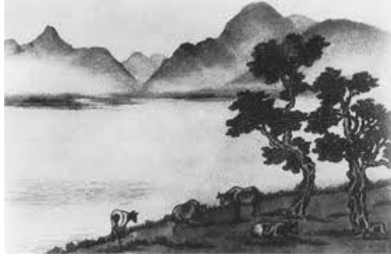
Figure 2 Chiang Yee's Cows in Derwentwater from The Silent Traveller, A Chinese Artist in Lakeland , first published in London in 1937.

Instead, space is utilized to accommodate the viewer as being within the scene, reflecting the feelings of intimacy and at-oneness with nature on the part of the artist (Barrow, 1995).