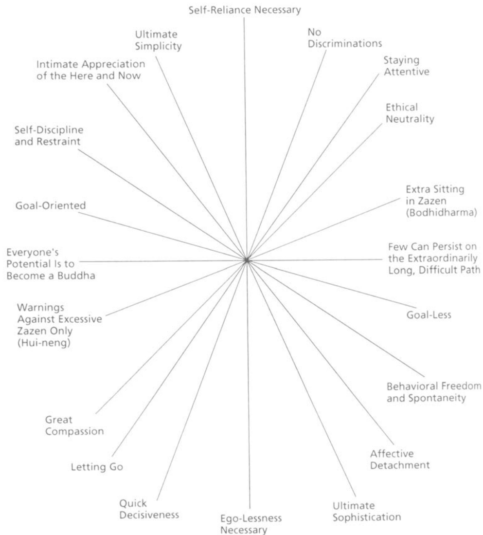
Figure 9 A Field of Paradox: Contrasting Aspects of Zen (Adapted from James Austin's Zen and the Brain , 1999)

One of the key paradoxes in the Zen tradition is the creative tension between rigorous discipline/structure and its spirit of unconventional irreverence for reliance on structure. Encountering Zen can be regimented and sober and at the same time incredibly iconoclastic and unpredictable. Steven Heine (2005) identifies this as the structure/anti-structure polarity in Zen. We must remember that Zen as an institution organized some of the most hierarchical and structured boot camps for the disciplined practice of meditation and the arts. From a competing