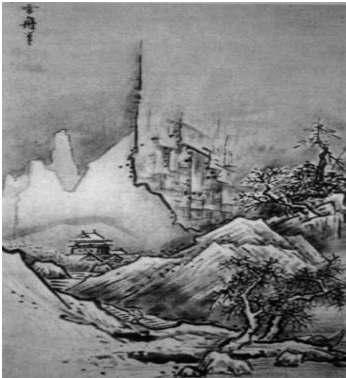
Figure 3. Sash, Winter Landscape

This is especially true for Zenga painting where the brushstrokes are very expressive and pronounced, ranging from delicate detail to powerful, bold outlines. Zenga and calligraphy visually demonstrate the aesthetic value of the imperfect, asymmetrical, and the so-called “controlled accidents” that are the result of stray brush lines and uneven inking of the paper. One of the most notable artists who mastered this style was Zen monk Sash (1421-1506), who was quite well known for zenga paintings that captured the evanescence of the changing four seasons (see Figure 3).