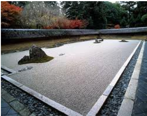
Figure 6 The Ryōan-ji Zen garden.

The most famous Zen garden, which has been the subject of innumerable interpretations, is the Ryoanji garden adjacent to a Rinzai Zen temple complex just north of Kyoto City. Originally built in 1450, it was reconstructed in 1486 after a fire. Ryoanji is relatively small rock garden, 10 x 30 meters in size (see Figure 6 below), consisting of 15 rocks of various sizes and shapes that sit arranged in raked grey gravel. The garden is backed by a low stone wall along the perimeter, and is open to the southern side of main temple hall's wooden veranda. There is no plant life introduced into the garden itself except for the moss that grows by the base of the rocks.