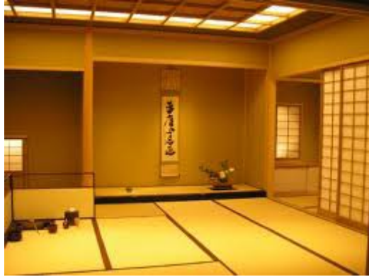
Figure 1 A Contemporary Tea Room

Sumi-e painting, Zenga and Calligraphy. Japanese painters were heavily influenced by the Chinese ink paintings (sumi-e). It is interesting to point out that Chinese classical studies integrated writing, poetry and painting. The role of the Chinese scholar was that of a generalist scholar-artist (Watts 1957). Zen monks emulated many of the aesthetic principles utilized among Chinese painters in the height of the Sung dynasty. These paintings were primarily of landscapes, depicting their feelings of naturalness towards mountains, trees, mists, waters, birds. However, the most distinct aspect of these paintings was an appreciation for space—and the relative emptiness of the picture. An aesthetic appreciation of space in the Zen sense is very different than Western conceptions of space as simply being a lifeless container for objects. As Herrigel describes it: