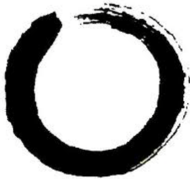
Figure 5 A Zen Enso.

Zen Poetry and Haiku. There are many aesthetic similarities between ink painting and Zen poetry/Haiku. As an art of expressing the inexpressible, the “wordless poetry” of Zen is known for what it does not say and for what it omits or leaves out. The artistic vision of Zen poets is similar to their ink painting counterparts in that Space is accentuated both in the outward expression and inward form of the poems. In the 11 th century, many Zen poets took their inspiration from Chinese couplets. Noting this aesthetic similarity, Watts points out: